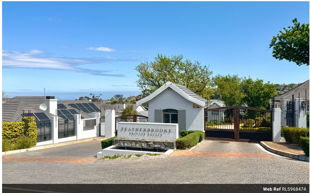
Web Ref RLS968474