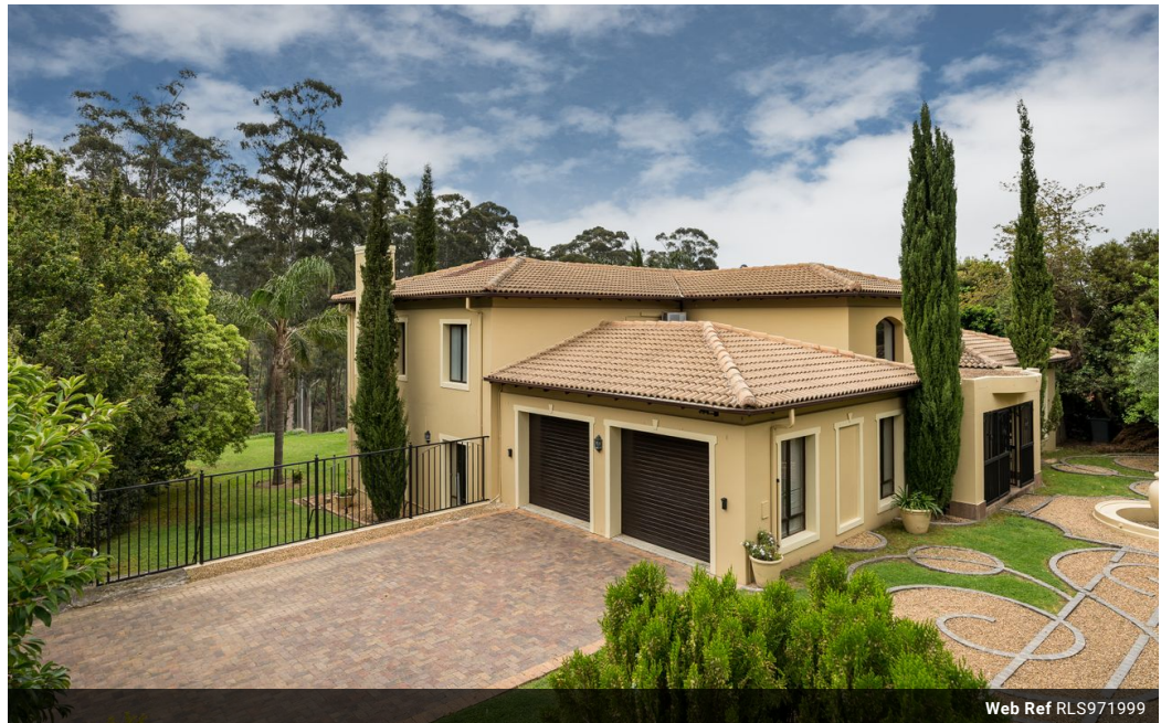
Web Ref RLS971999